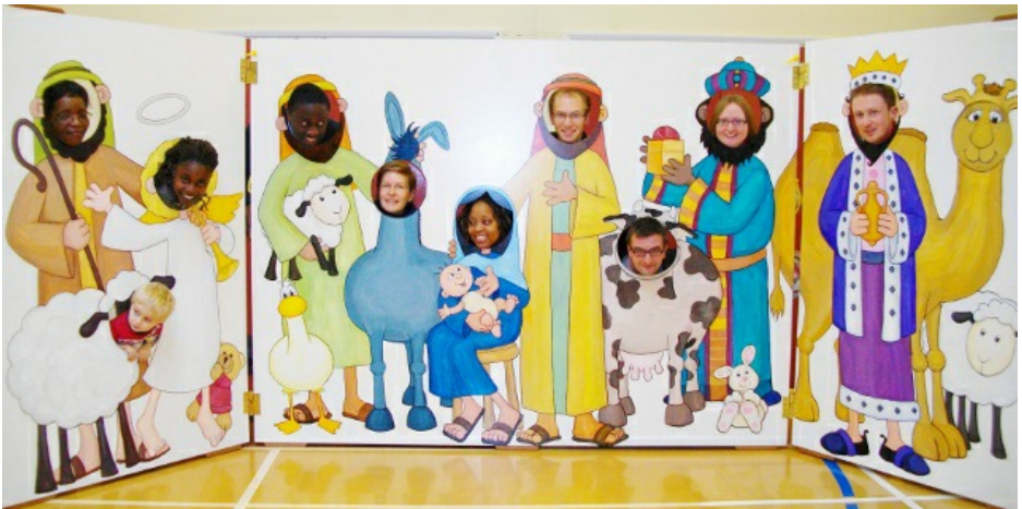
20s-30s Cell Group