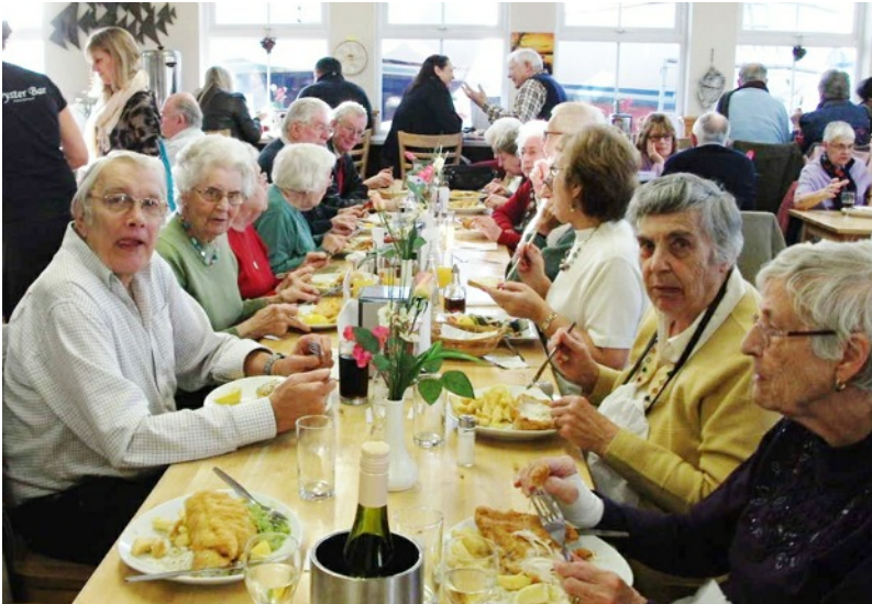
Retreads enjoying themselves at the Oyster Bar, Mersea in November

If you would like to come than please add your name to the list and indicate your choice and if you require transport. The closing date is 15th January and I would like all payment by then please.